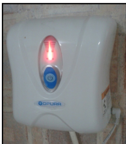
Figure 3: OPURA - Ozone generator.

disinfection of the files, each file placed in separate tubes with the help of a sterile tweezer.