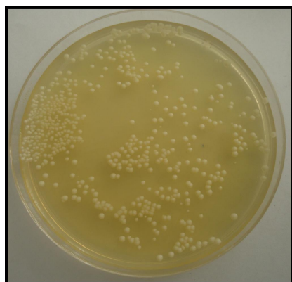
Figure1: growth of Candida spp. On SDA.

A swab of a lesional site from the oral cavity of leukemic patients (symptomatic patients) is a relatively simple method of detecting growth of Candida can be obtained. The sampling approach involves gently rubbing a sterile cotton swab over the lesional tissue of oral patient, and then subsequently inoculating a primary isolation and differential culture medium such as Sabouraud Dextrose Agar (SDA) were white to cream, round, curved, soft and smooth to wrinkled (figure 1), with a characteristic yeast odor, it was growing rapidly and incubated at 37°C for 24-48 hrs. (15)